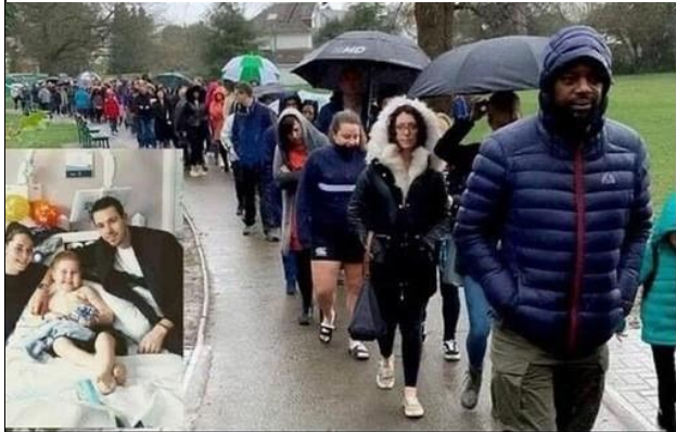
Almost 5,000 people queued for hours in the rain at a swabbing event in Worcester, to get tested to see if they were a match to help save the life of a five-year-old boy fighting a rare cancer after parents asked for help.