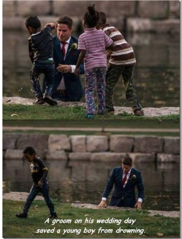
A groom on his wedding day saved a young boy from drowning.